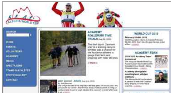
Official Event Website