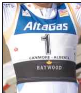
General Race Bib