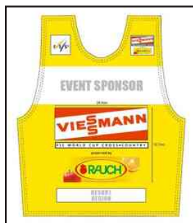
FIS Leader Bib