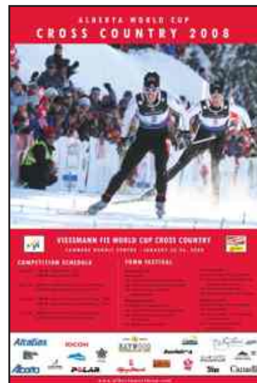
Event Posters, Billboards, etc.