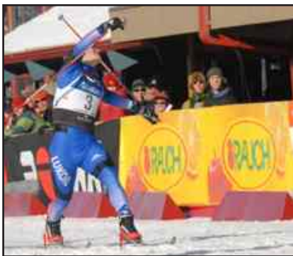
On Course Signage (100x500cm)