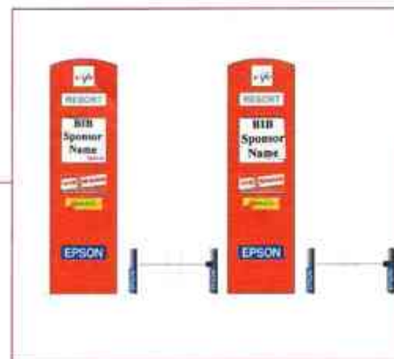
Sprint Start - Gate Branding